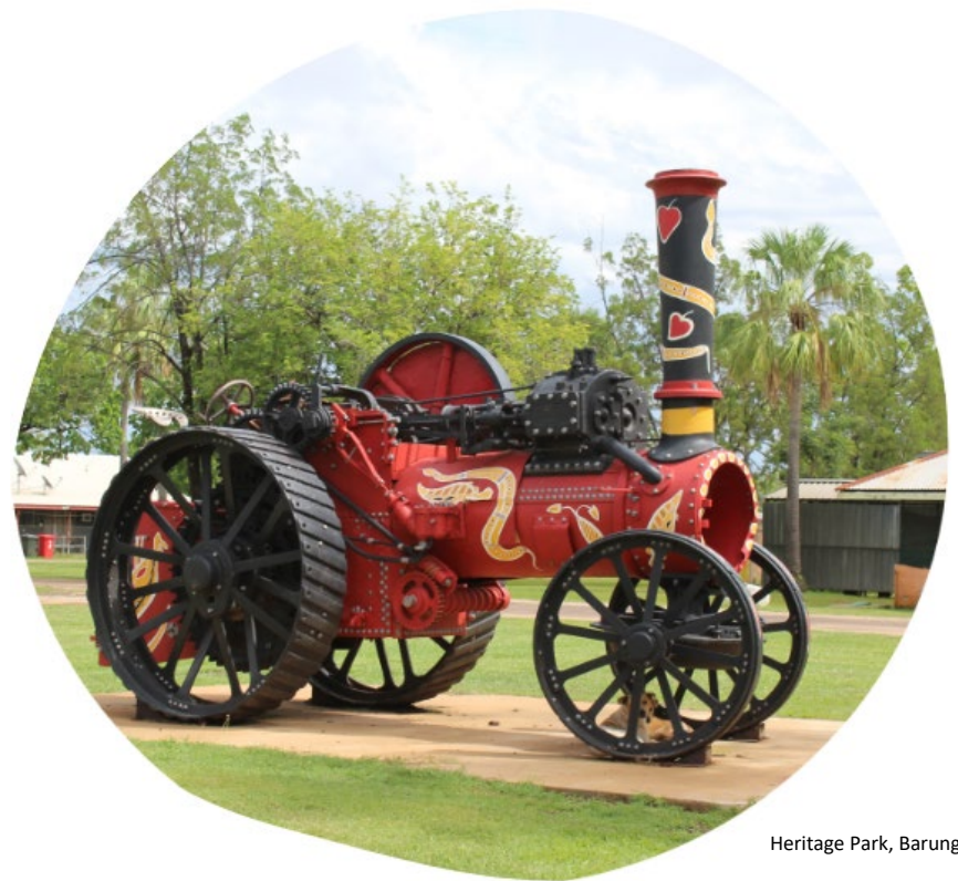
Heritage Park, Barunga