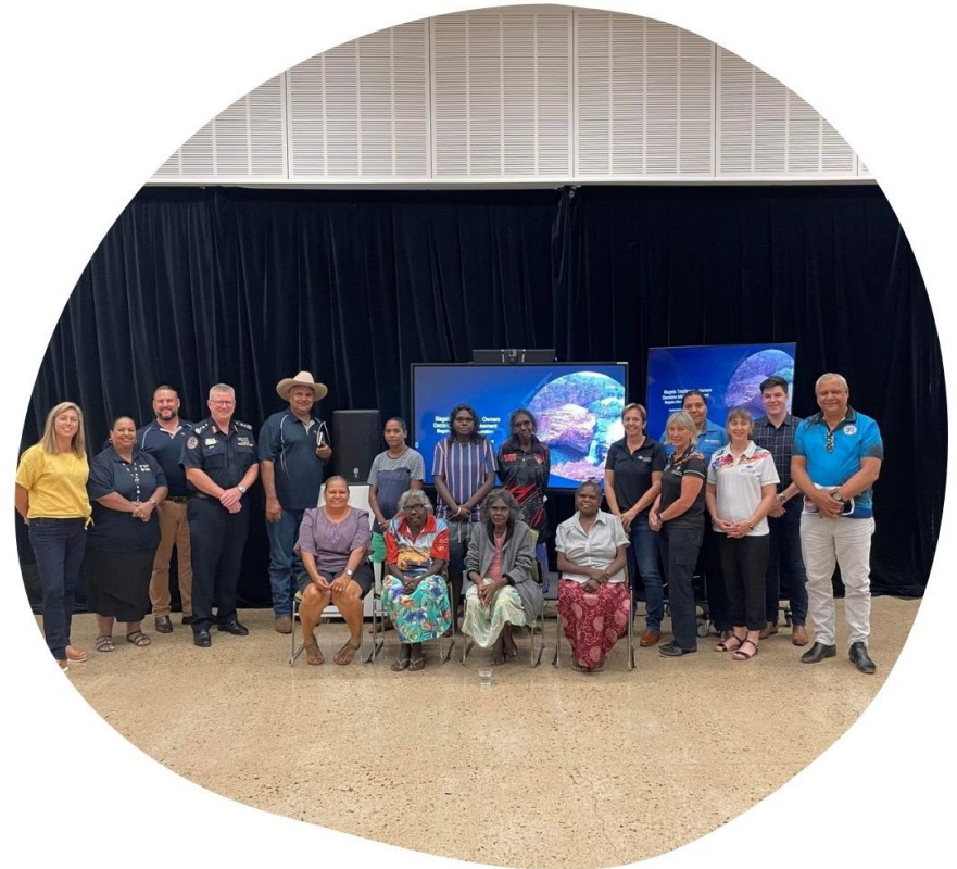
LDM workshop, BAC board and partners

The IP commences 7 December 2022 and expires 7 December 2025. Following this plan parties should meet again to formalise a new IP. Responsibilities for the execution of specific actions are outlined within the IP.