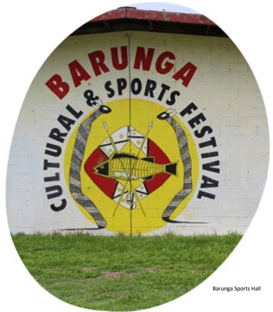
Barunga Sports Hall